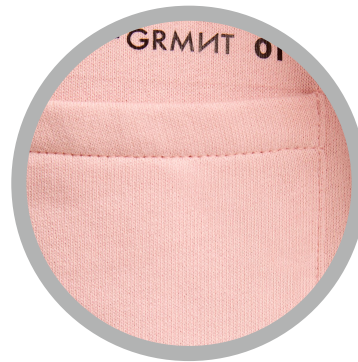
BACK POCKET DETAIL