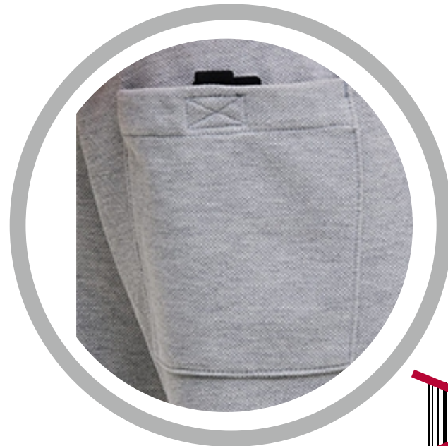
BACK POCKET DETAIL