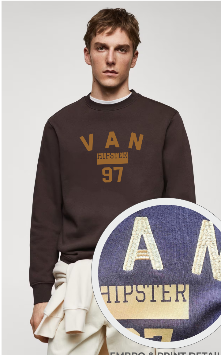
EMBRO & PRINT DETAIL